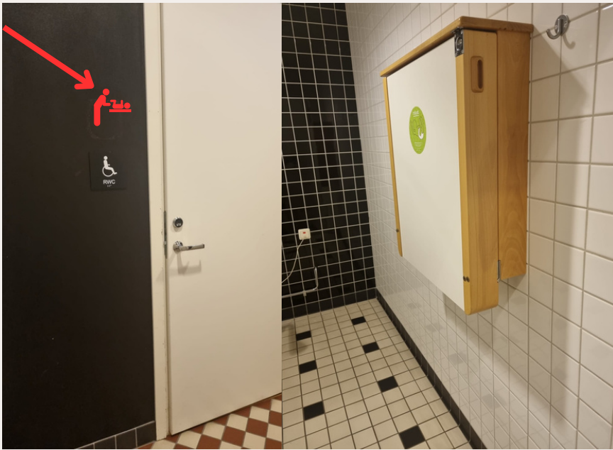
Pic 1 - Toilet room 334 G- proposal