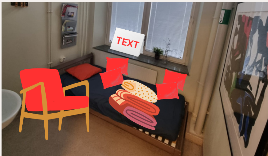
Pic 3 - Resting room Valand proposal