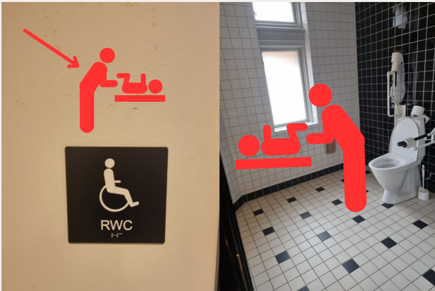
Pic 2 - Toilet room 419 D- proposal